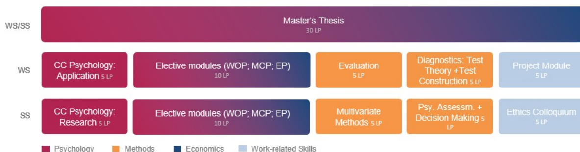
Image 1: Full-time study plan. CC: Cross-Cultural, WOP: Work and Organizational Psychology, MCP: Market and Consumer Psychology, EP: Economic Psychology.